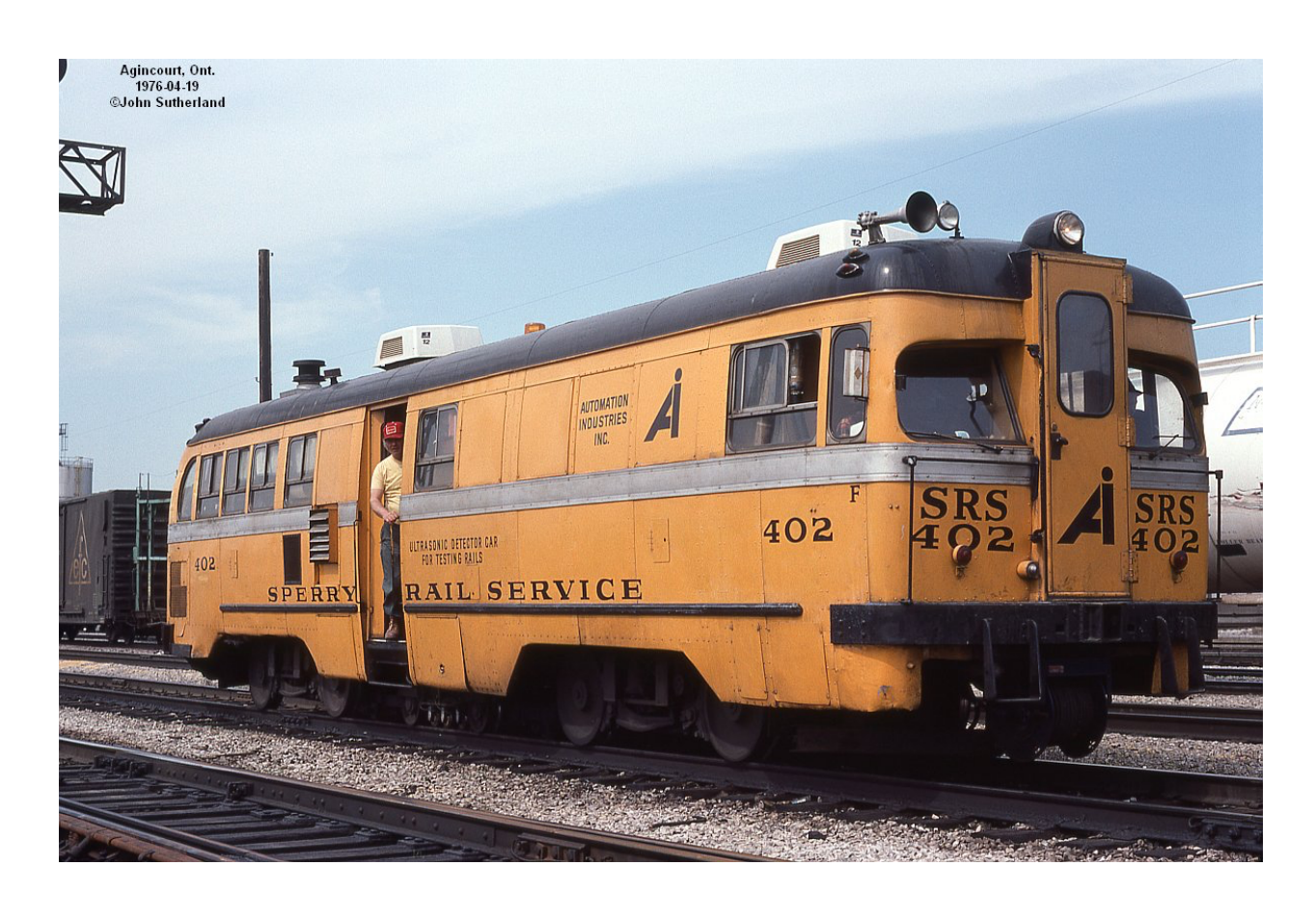
Rail Safety Week - September 19 to 25, 2022