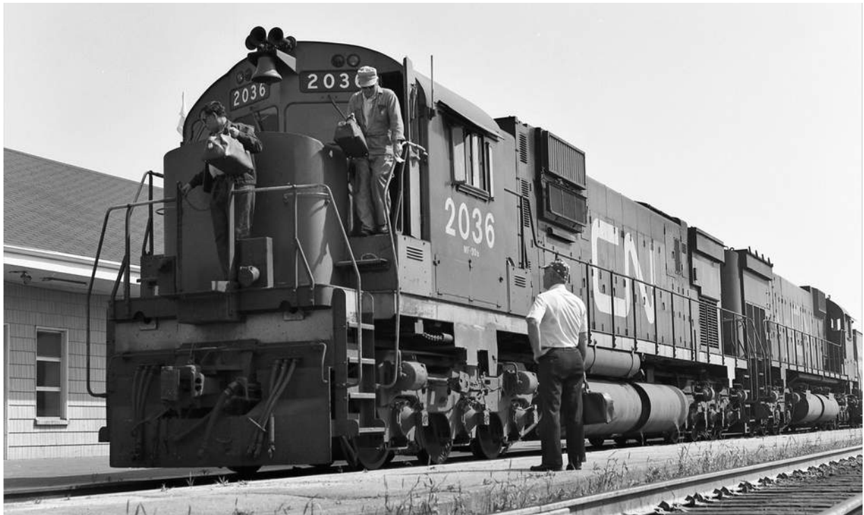
CN 2036 Brockville crew change 23 June 1973

To grow this association with integrity, for the people and by the people with a team of volunteers whose ultimate goal is to do their best in an effort to achieve a better standard of living for our fellow pensioners and surviving spouses.