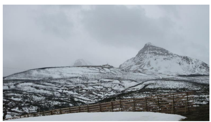
Nice spring day for a drive, summit of the pass south of St. Mary' enroute to Babb, Montana